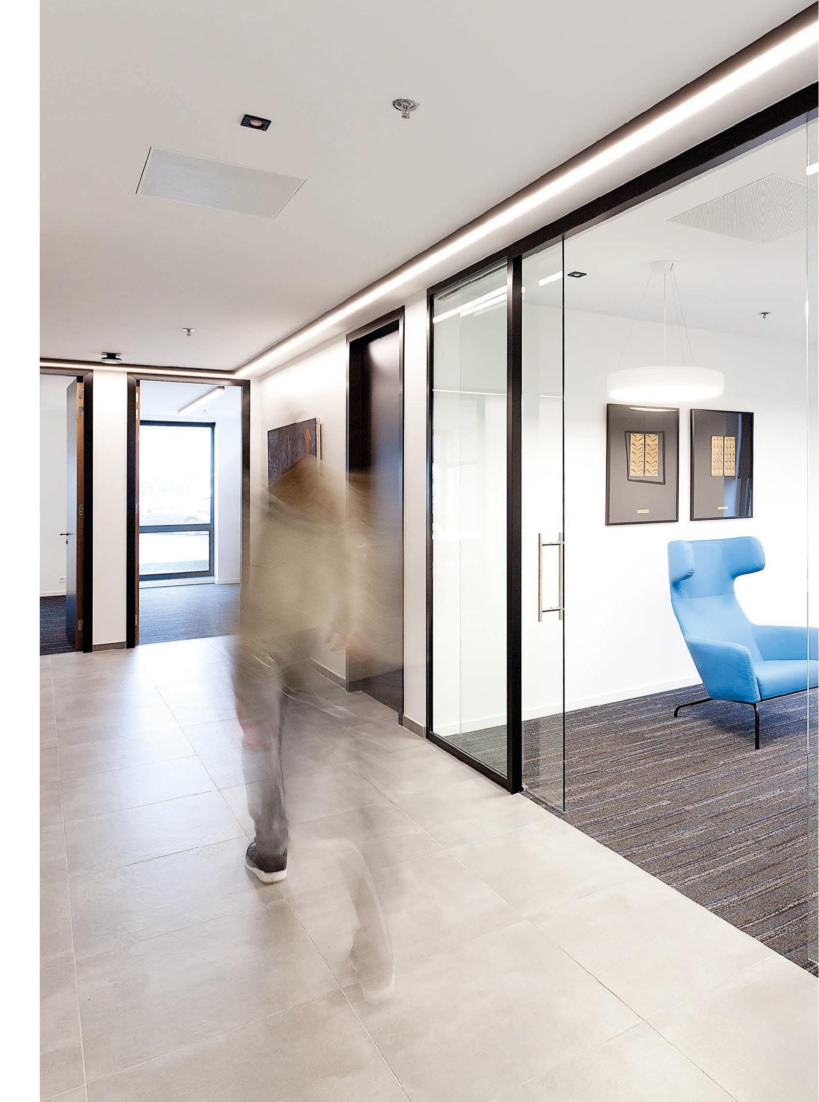
Page 10 /12 - Code of conduct

In case of any questions about this Code, contact your supervisor or Sioen's Compliance Officer at compliance@sioen.com.